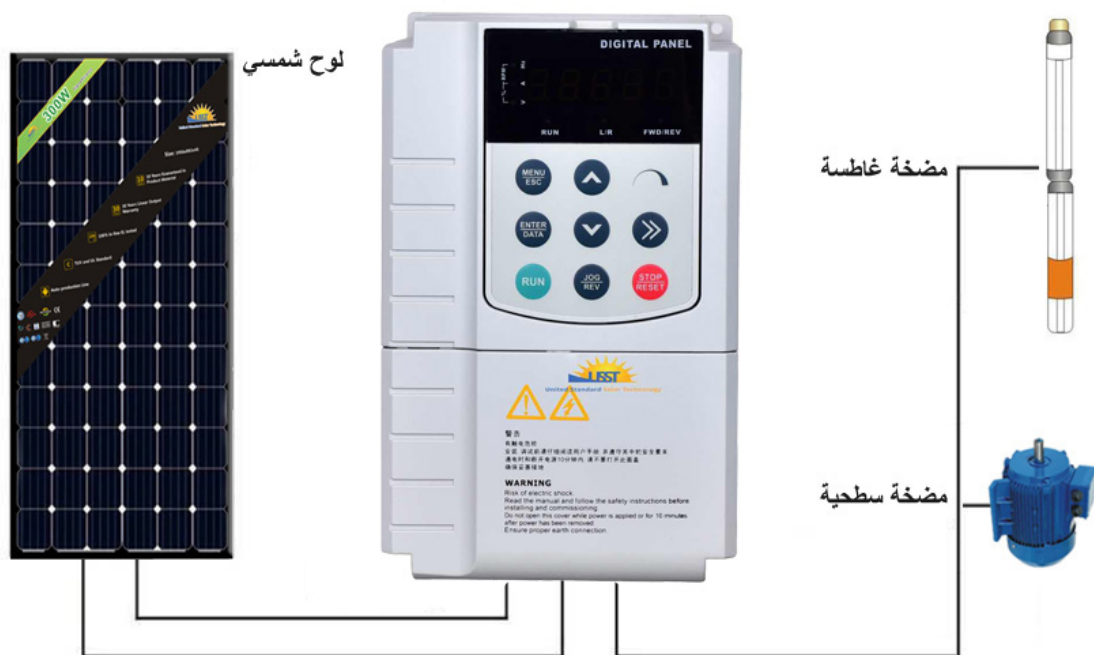
Figure 2 Structure of solar pumping system

Pump, drive by 3-phase AC motor, can draw water from the deep wells or rivers and lakes to pour into the storage tank or reservoir, or directly connect to the irrigation system, fountain system, etc.